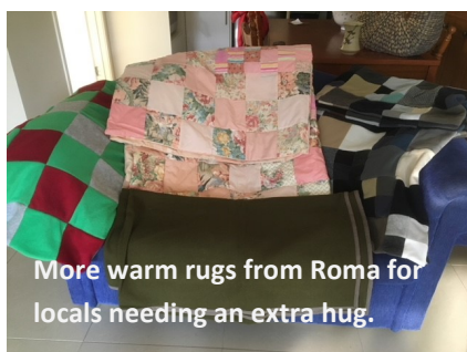
More warm rugs from Roma for locals needing an extra hug.