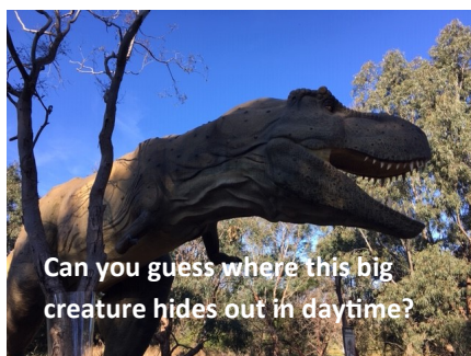
Can you guess where this big creature hides out in daytime?