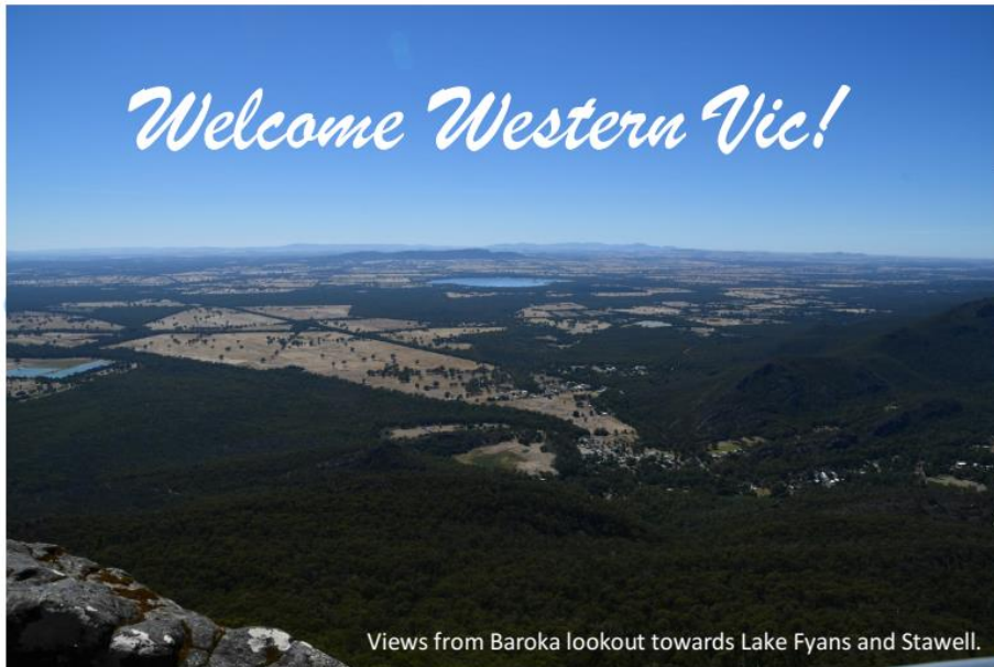
Views from Baroka lookout towards Lake Fyans and Stawell.