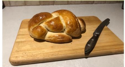
My mum's first “lockdown loaf” - August, 2020!

When we are open to receiving people as they are, we allow ourselves to be changed by them, like yeast in flour, the Kingdom of God among us: creating, transforming, nurturing.