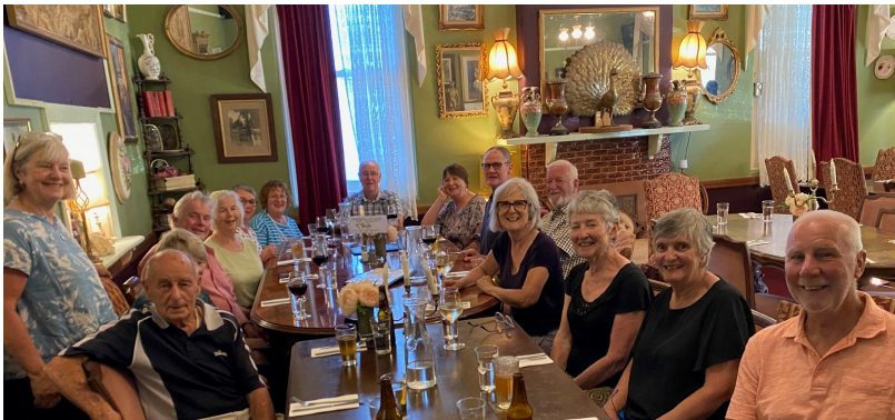
Dinner at the Victoria Pub

Some members of each surfcoast congregation took up the invitation to spend a few days at Dimboola on the Wimmera River this past week. We swam, and fished, and chatted and walked, and ate and chatted and enjoyed coffee and all the Dimboola and Little Desert delights. Some stayed in tents, some in caravans and some in cabins, but we all shared ourselves and cake!