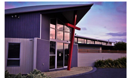
Launceston North Uniting Church

On the Surfcoast we have been paired with Launceston North Uniting Church , where their Minister is on a cancer health journey and their congregation continues to connect strongly with their community. Check out their FB page called "The Haven LNU" to get an idea of what's happening.