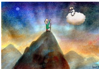
Image – Leunig used with permission

in ancient times people believed God dwelled on mountaintops and in clouds. People also believed God dwelled in the Temple and tents. Here's Leunig's cartoon. He's on a mountaintop waving to God.