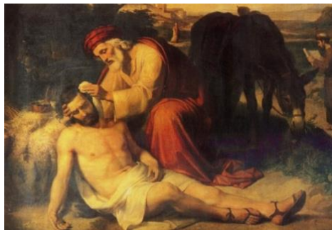
Clavé, Pelegrín, 1810-1880 RCL

God of mercy and kindness Open our hearts to your love