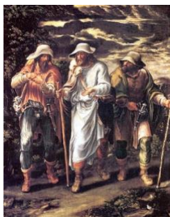
The Road to Emmaus