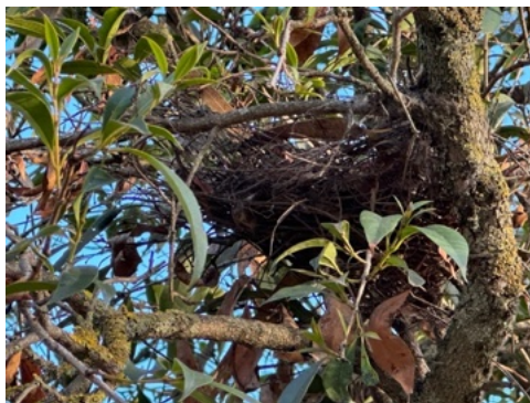
Nesting - T. Lyndon